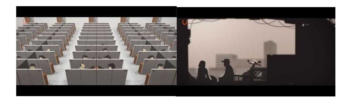
Figure 5. Social discrepancy highlighted in "Surat Untuk Jakarta"

At the analysis stage, various types of shots were found which described the beauty of Jakarta city, but there were also shots showing Jakarta's poverty, this bring out the meaning that economic discrepancy towards people of DKI Jakarta. It's Like the shot which shows the contrast between the rich and the poor. There are buildings, yet there are also slums. As stated on the news concerning DKI Jakarta Economic Inequality which stated in the Suara Pembaruan: Jakarta, as in plain view, is not only an alignment of tall buildings soaring in the central area of modern business but also there are districts of slums.