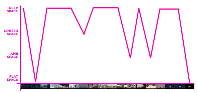
Figure 1. Space in the film "Surat Untuk Jakarta"

In terms of space, this film the visual spikes occur. According to Bruce Block, visual spikes in a film indicate the quantity of conflicts created in this film. Visual spikes in this case are indicated by many differences in the use of space in each shot. In this film, deep space is the type of space that is most widely used, meaning that there is a conflict to be conveyed.