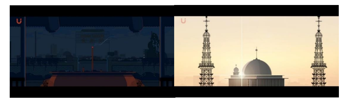
Figure 6. Religious tolerance in the "Surat Untuk Jakarta" film

This film describes how religious tolerance in Jakarta is preserved in the form of two descriptive shots, by simply visualizing the worship places of different religions which existed side by side. However, both of these shots have indicated three attitudes of diversity in the community, namely: the first nature is accepting others based on the concept of peaceful coexistence (no riots arise when both religions (Islam and Hinduism) perform rituals at the same time), the second nature is responding to the problem (seen from the numbers of news about the Istiqlal Mosque is often provide parking to Catholics while on Christmas ceremony, and vice versa) and for the third nature, both shots represent that Jakarta actually has a theological foundation for each people to build the spirit of unity of mankind.