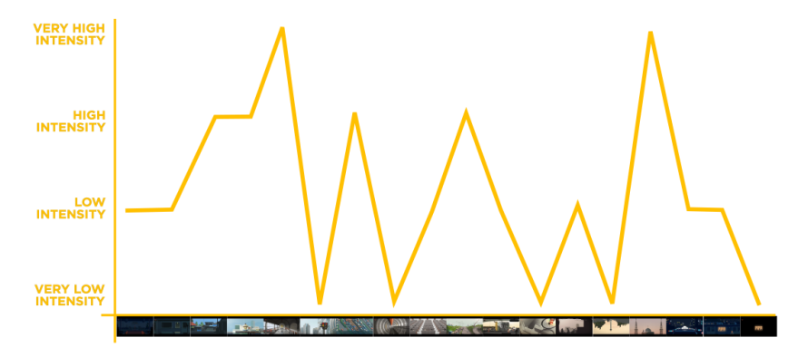
Figure 2. Movement in the movie "Surat Untuk Jakarta"

The objects movement in this film has a high dynamic. Nearly many shots indicate the objects movement against the building horizon. Generally, the intensity of the film movement for Surat Untuk Jakarta is very fluktuative. Fluctuating graphics indicate that this film is very dynamic in its movements.